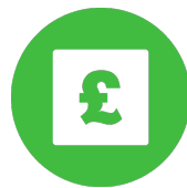
In App purchasing