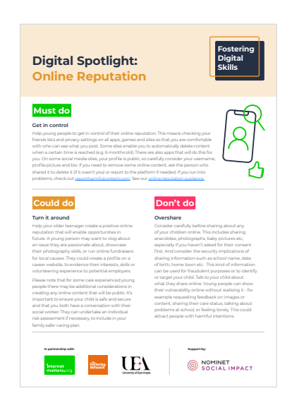
Digital Spotlight: Online Reputation