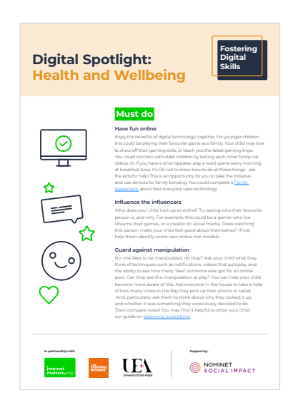
Digital Spotlight: Health and Wellbeing