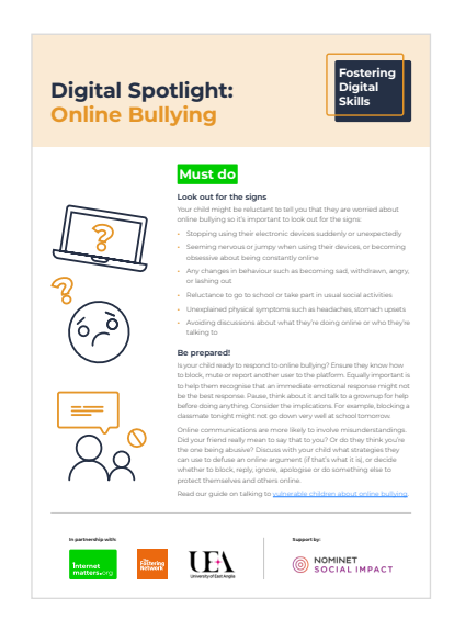
Digital Spotlight: Online Bullying