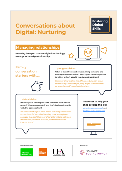
Conversations about Digital: Nurturing