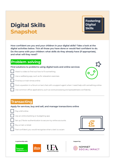
Digital Skills Snapshot

Throughout the course we've referenced different ways to report illegal content online. Here's a reminder.