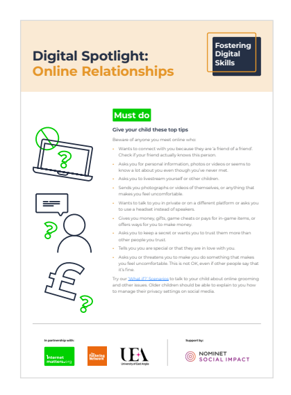
Digital Spotlight: Online Relationships