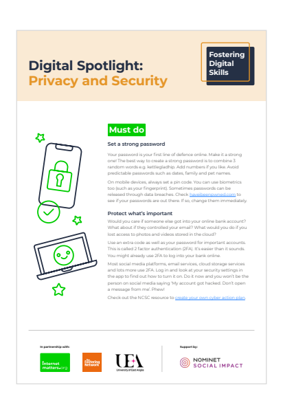
Digital Spotlight: Privacy and Security