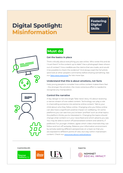
Digital Spotlight: Misinformation