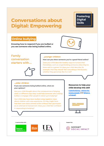
Conversations about Digital: Empowering