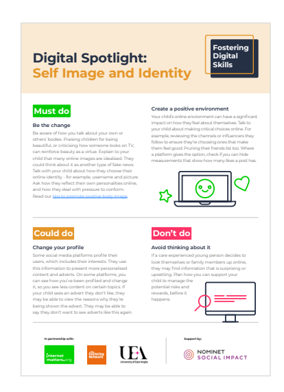
Digital Spotlight: Self Image and Identity