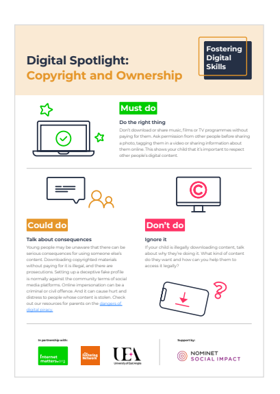
Digital Spotlight: Copyright and Ownership